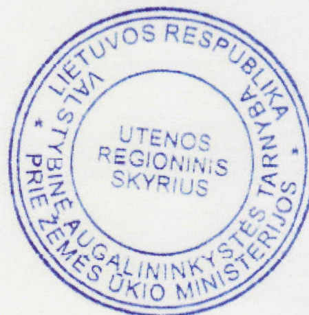
Regional post of Utena