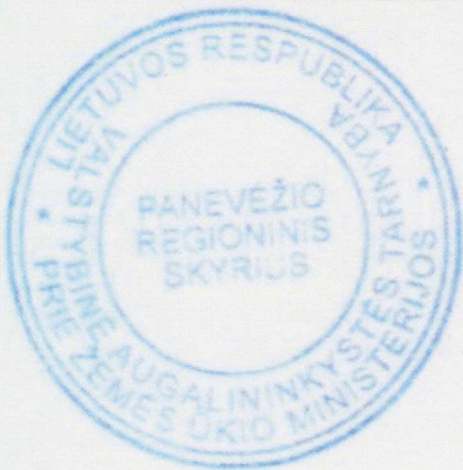
Regional post of Panevezys