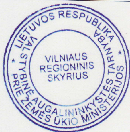
Regional post of Vilnius