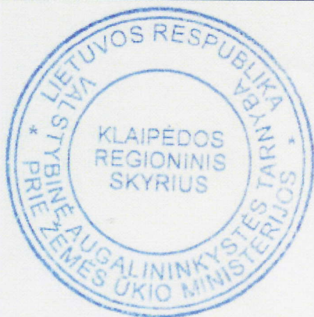
Regional post of Klaipėda