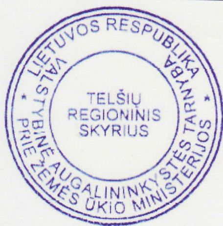
Regional post of Telsiai