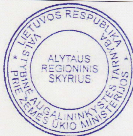
Regional post of Alytus