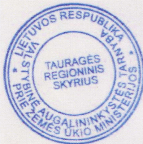
Regional post of Tauragė