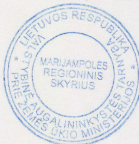
Regional post of Marijampolė