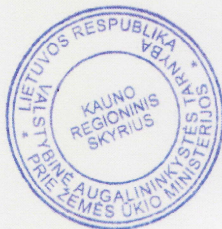
Regional post of Kaunas