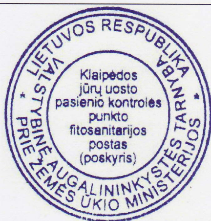
Border post of see port of Klaipėda