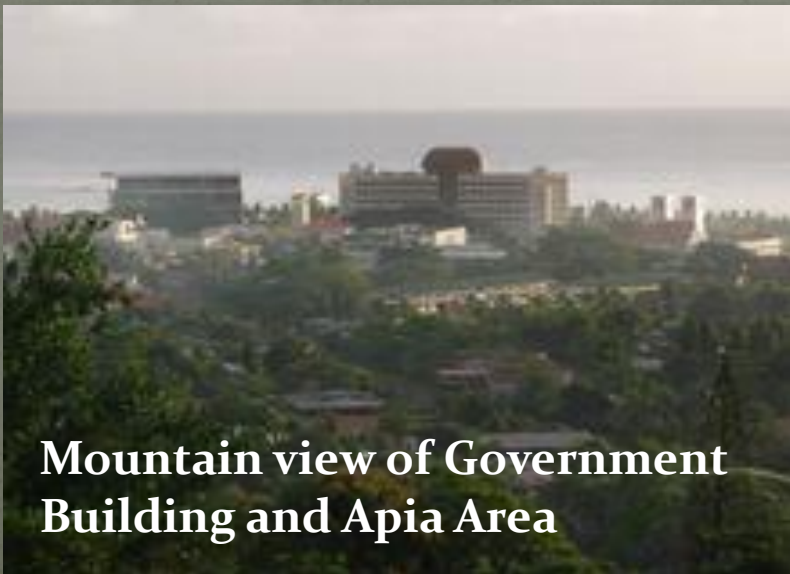
Mountain view of Government Building and Apia Area