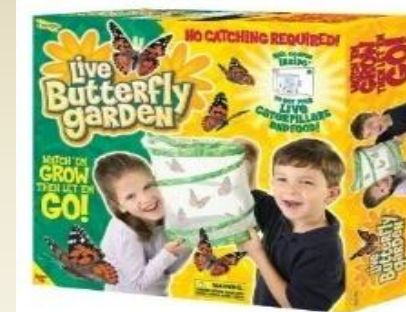
Butterflies as pets