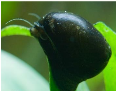
Nerita sp. snail advertised as biocontrol agent of algae in aquaria