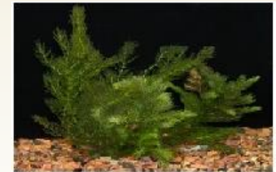
Aquatic plants Eichhornia crassipes & Ceretophyllum demersum