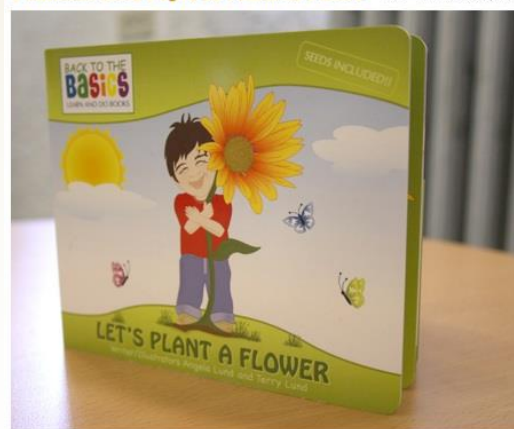
Plantable Seed Paper in Children's Book SEPTEMBER 26, 2011

International Plant Protection Convention Protecting the world's plant resources from pests