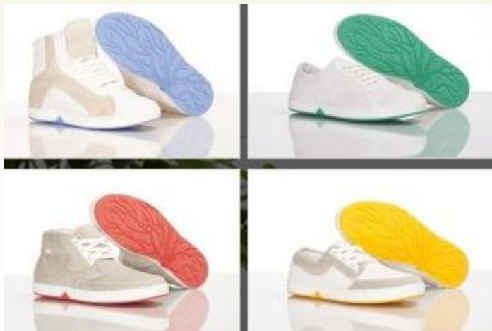
Shoes infused with seeds