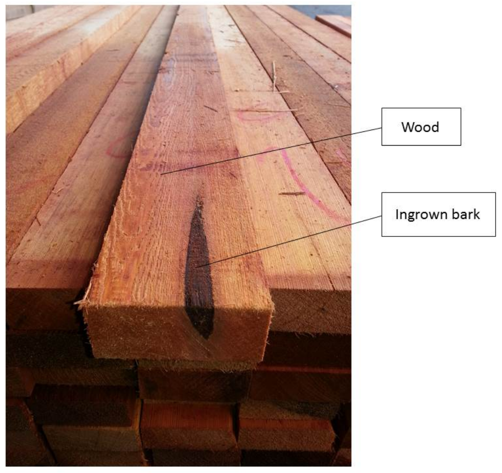
Figure 3. Sawn wood.