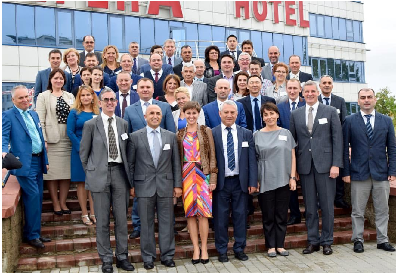
Regional Workshop on Phytosanitary, Minsk, Belarus, 5-9 September 2016

Food and Agriculture Organization of the United Nations