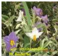
Solanum eleagnifolium Invasive Alien Species spreaded in all the NENA region

Prickly pear cochineal: Dactylopius opuntiae Spreading in Morocco, risk for Algeria