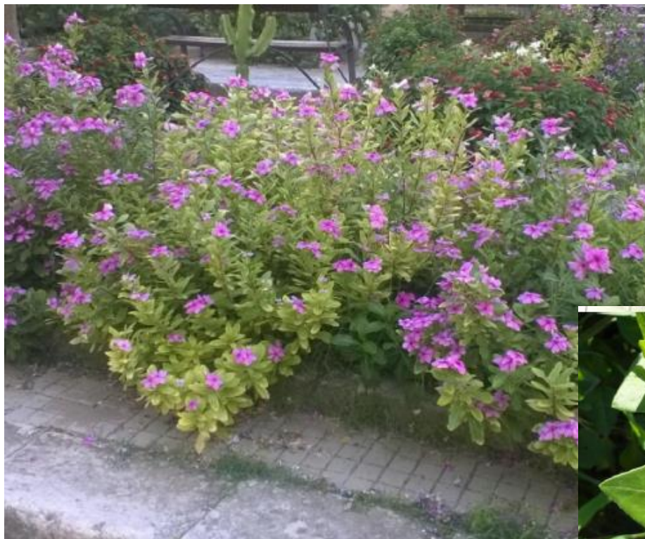
❑ Vinca spp.