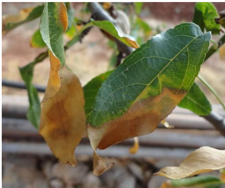
❑ Prunus dulcis