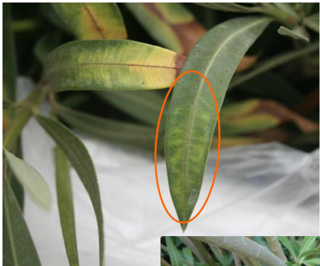
❑ Nerium oleander