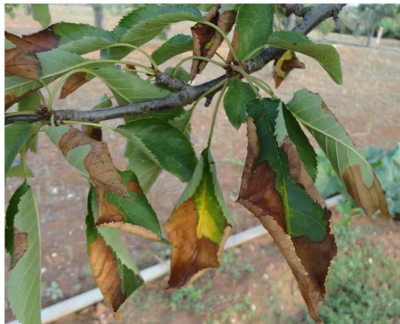
❑ Prunus avium