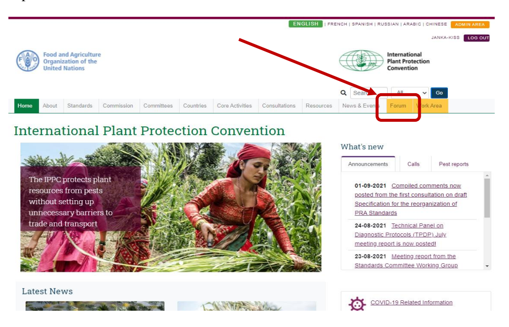
Figure 1: How to find the "Forum" tab

(5) By visiting the Forum, you can see all the current e-decisions listed. Click on the title of the one you would like to comment on.