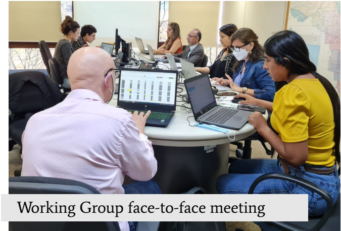
Working Group face-to-face meeting