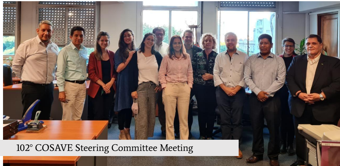
102° COSAVE Steering Committee Meeting