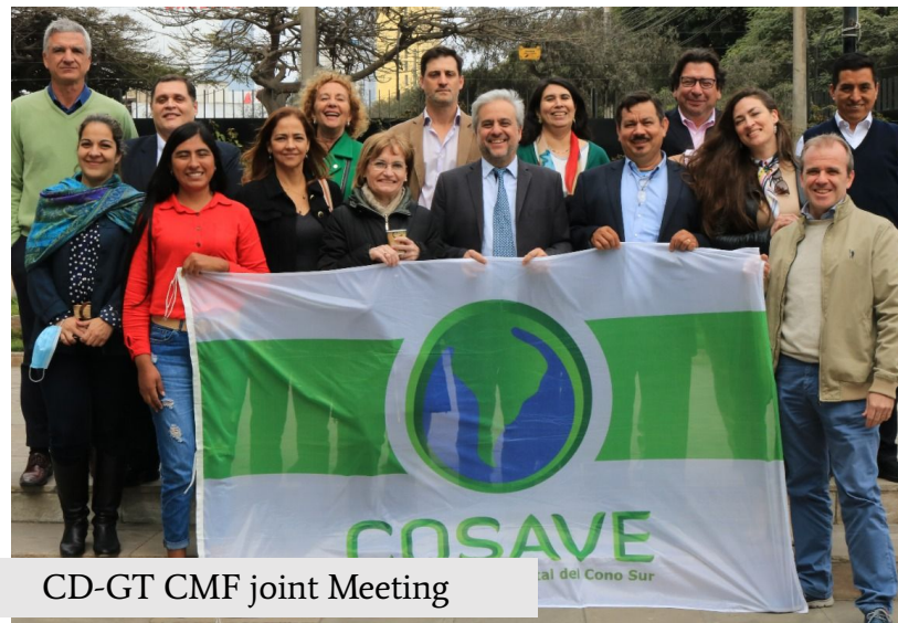
CD-GT CMF joint Meeting