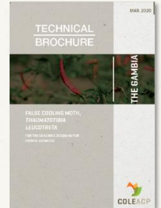
Control specific pests