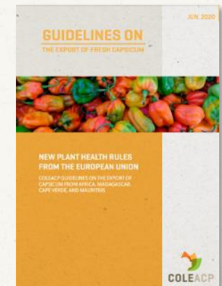
Comply with market requirements