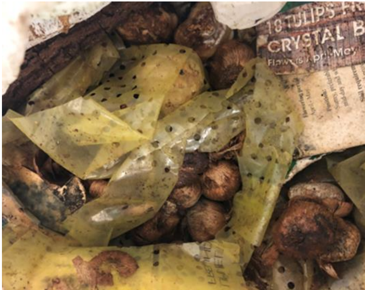
Lack awareness of import requirements