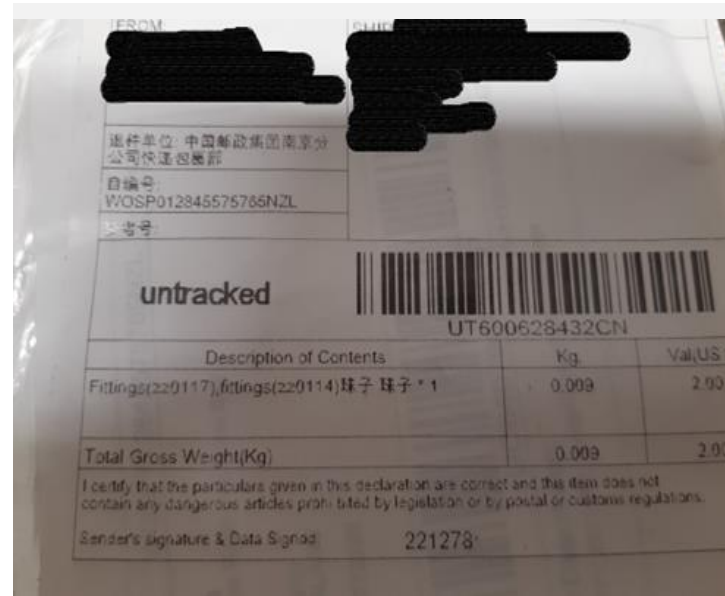
Unsolicited or deliberately mis-declared risk goods