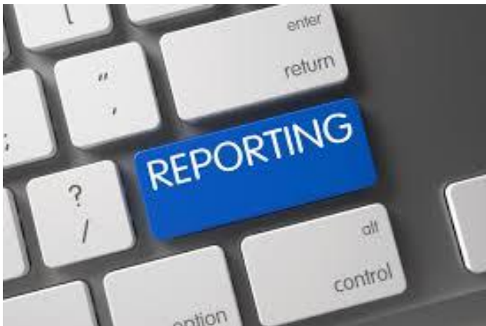
Existence of reporting systems