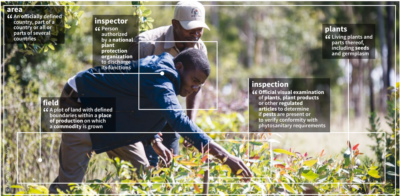
Forestry researchers inspect trial eucalyptus seedlings at a nursery in the Republic of Zimbabwe.