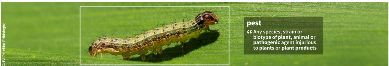
A close-up of a Fall Armyworm ( Spodoptera frugiperda ) infesting a maize crop in the North Central province of the Democratic Socialist Republic of Sri Lanka.