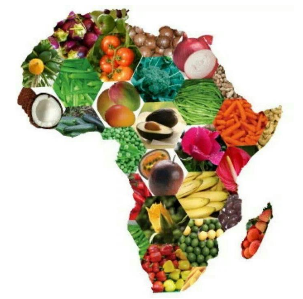
Africa Phytosanitary Programme · 23–27 June 2025