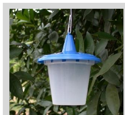
Figure 14. Sensus trap.