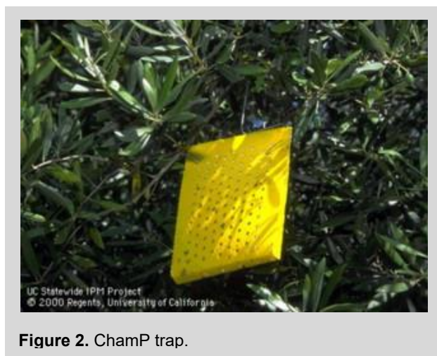
Figure 2. ChamP trap.