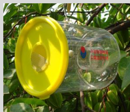
Figure 16. Steiner trap version.