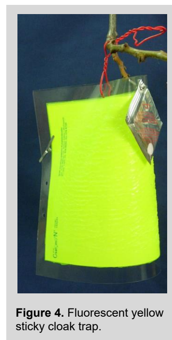
Figure 4. Fluorescent yellow sticky cloak trap.