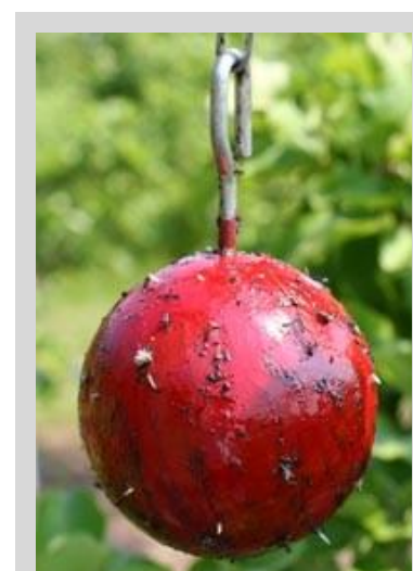
Figure 13. Red sphere trap.

Many types of insects will be caught by these traps. It will be necessary to positively identify the target fruit fly from the non-target insects likely to be present on the traps.