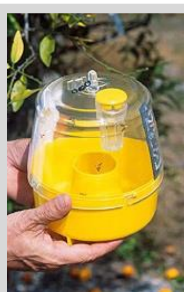
Figure 11. Multilure trap.