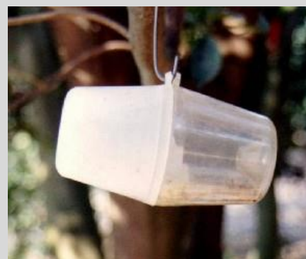
Figure 17. Steiner trap version.