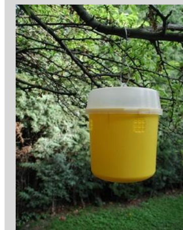
Figure 18. Tephri trap.

The YP consists of a yellow rectangular cardboard plate (23 cm × 14 cm) coated with plastic (Figure 19). The rectangle is covered on both sides with a thin layer of sticky material. The RB trap is a three-dimensional YP-type trap with two crossed yellow rectangular plates (15 cm × 20 cm) made of plastic (polypropylene), making them extremely durable (Figure 20). The trap is also coated with a thin layer of sticky material on both sides of both plates. A wire hanger, placed on top of the trap body, is used to hang it from tree branches.