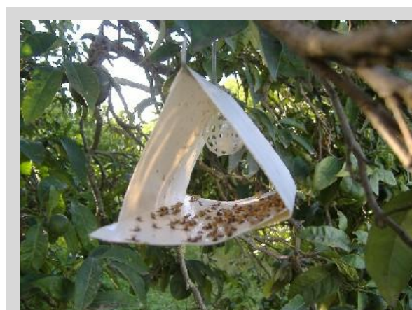
Figure 5. Jackson trap or Delta trap.

For many years this trap has been used in exclusion, suppression or eradication programmes for multiple purposes, including population ecology studies (seasonal abundance, distribution, host sequence, etc.); detection and delimiting trapping; and surveying sterile fruit fly populations in areas subjected to sterile fly mass releases. JT or Delta traps may not be suitable for some environmental conditions (e.g. rain or dust).