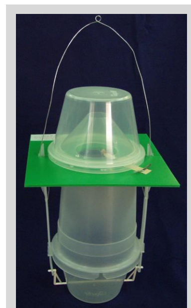
Figure 10. Modified funnel trap.

When the MLT is used as a dry trap, a suitable (non-repellent at the concentration used) insecticide such as dichlorvos or a deltamethrin (DM) strip is placed inside the trap to kill the fruit flies. DM is applied to a polyethylene strip placed on the upper plastic platform inside the trap. Alternatively, DM may be used in a circle of impregnated mosquito net and will retain its