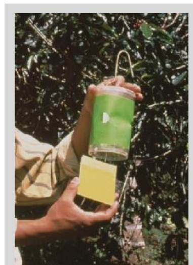
Figure 12. Open bottom dry trap (Phase IV).

A food-based synthetic chemical female-biased attractant can be used to capture C. capitata . However, it also serves to capture males. Synthetic attractants are attached to the inside walls of the cylinder. Servicing is easy because the sticky insert permits easy removal and replacement, similar to the inserts used in the JT. This trap is less expensive than the plastic or glass McP traps.