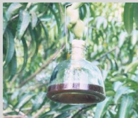
Figure 8. McPhail trap.

The conventional McP trap is a transparent glass or plastic pear-shaped invaginated container. The trap is 17.2 cm high and 16.5 cm wide at the base and holds up to 500 ml of solution (Figure 8). The trap parts include a rubber cork or plastic lid that seals the upper part of the trap and a wire hook to hang the trap on tree branches. A plastic version of the McP trap is 18 cm high and 16 cm wide at the base and holds up to 500 ml of solution (Figure 9). The top part is transparent and the base is yellow.