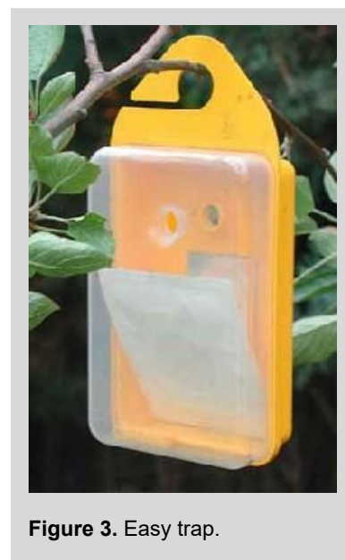
Figure 3. Easy trap.

The trap is multipurpose. It can be used dry baited with male lures (e.g. TML, CUE, ME) or synthetic food attractants (e.g. 3C and both combinations of 2C attractants) and a retention system such as dichlorvos. It can also be used wet baited with liquid PAs, holding up to 400 ml of mixture. When synthetic food attractants are used, one of the dispensers (the one containing putrescine) is attached inside the yellow part of the trap and the other dispensers are left free.