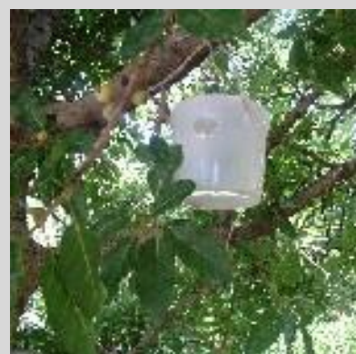
Figure 7. Maghreb-Med trap or Morocco trap.

CUE and ME attractants, which are ingested by the male fruit fly, are mixed with malathion. However, because CE and TML are not ingested by either C. capitata or C. rosa , a dichlorvos-impregnated matrix is placed inside the trap to kill fruit flies that enter.