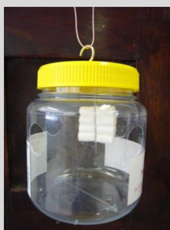
Figure 6. Lynfield trap.

The trap uses an attractant and insecticide system to attract and kill target fruit flies. The screw-top lid is usually colour-coded to the type of attractant being used (red, Capilure (CE)/TML; white, ME; yellow, CUE). To hold the attractant a 2.5 cm screw-tip cup hook (opening squeezed closed) screwed through the lid from above is used. The trap uses the male lures CUE, CE, TML and ME.