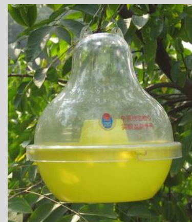
Figure 9. Plastic McPhail trap.