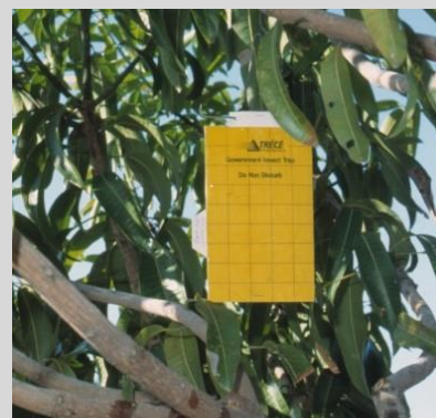
Figure 19. Yellow panel trap.