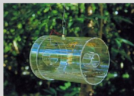
Figure 15. Conventional Steiner trap.