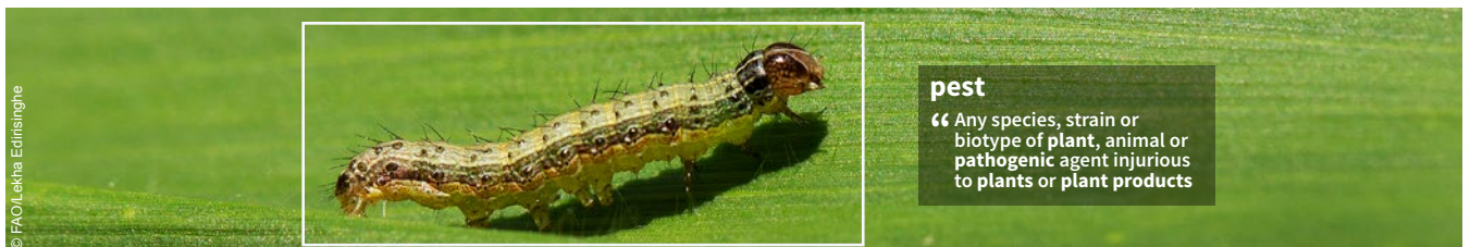
A close-up of a Fall Armyworm ( Spodoptera frugiperda ) infesting a maize crop in the North Central province of Sri Lanka.