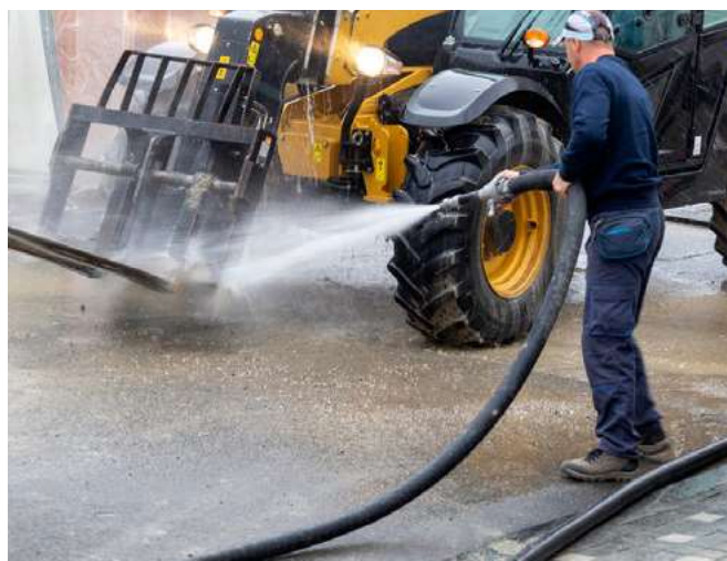
To assist on-ground staff thoroughly clean all VME prior to export.