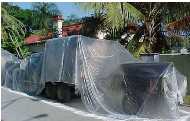
Protect vehicles for export from contamination with plastic coverings (C. Dale).

To ensure that our staff can focus effort on other priority activities such as food and shelter distribution, please help us by taking steps to mitigate the pest risk of donated goods prior to export . For VME, this may include cleaning, decontamination, disinfestation and pre-clearance ahead of shipment.